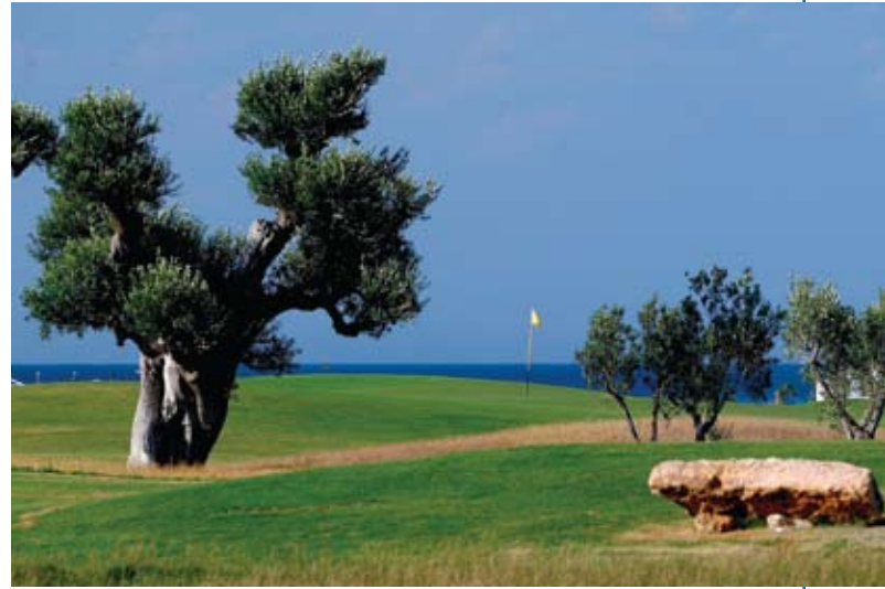
San Domenico Golf Club

Sit back and watch skilled deckhands scale the rigging and set the sails on what is the finest hand-sailed, square-rigger of our age. What better way to settle in aboard Sea Cloud II than to delight in a full day at sea? This mesmerizing voyage through the intensely blue waters of the Adriatic takes us along spectacular coastlines, fascinating towns and ancient fortresses that held rule over the ancient world.