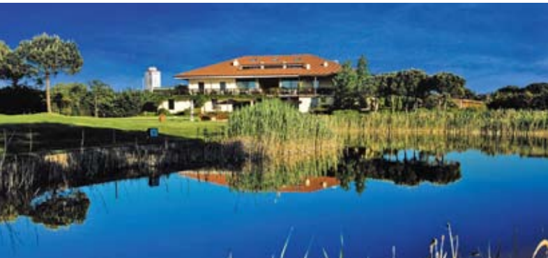
Adriatic Golf Club

Porto Mariccio Golf Course. This challenging 18-hole course at the Porto Mariccio Resort enjoys stunning views of Piran, Portoroz and, on clear days, even Venice. Well-placed bunkers and undulating greens will reward golfers' accuracy. Today we tour the town of Pula, situated at the southern tip of the Istrian peninsula. Located beneath seven hills and with views of the Adriatic, Pula has a long tradition of shipbuilding and serves as one of the most important naval bases in Croatia. It is also home to many ancient Roman buildings, including its magnificent amphitheater, one of the six largest Roman amphitheaters existing today.