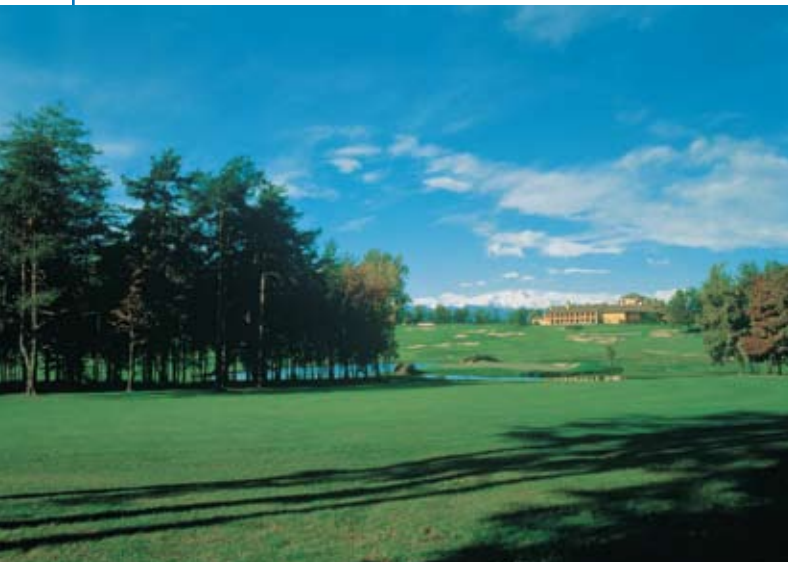
Castelconturbia Golf Club

Depart your home city on October 11 for an overnight flight to Milan, Italy. Upon arrival you'll be greeted at the airport and transported to the Grand Hotel des Iles Borromées. The Iles Borromées is ideally located overlooking Lake Maggiore. It is no wonder that Hemingway used this hotel as his base to write A Farewell to Arms . This evening we gather in the gardens overlooking the lake for our welcome reception.