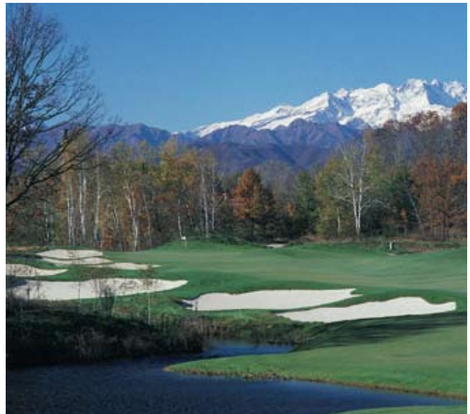
Bogogno Golf Club

Bogogno Golf Club. Monte Rosa and the Italian Alps are the scenic backdrop to this Robert von Hagge layout that meanders through the countryside. Undulating fairways are bordered by flowing streams that feed several lakes, bringing water into play on many holes. Bogogno Golf Club offers a myriad of hazards that will test any golfer's skill. Those on tour visit Milan, home to da Vinci's Last Supper and the world famous La Scala Theater and museum. Some may spend the day on Via Montenapoleone, one of Italy's most famous shopping streets, considered by some to be the epicenter of the fashion world.