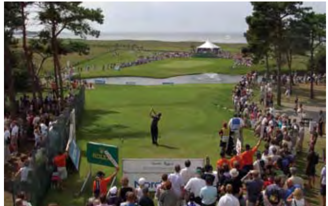
Barsebäck Golf & Country Club Scandinavian Masters

Barsebäck Golf & Country Club. The Masters Course at Barsebäck frequently hosts the European PGA Tour's Scandinavian Masters and was the site of the 2003 Solheim Cup. The course offers splendid views over the Öresund and an interesting array of parkland and seaside holes. Our tour will venture by boat to the little island of Hven, noted for its natural beauty as well as for the observatory of the Renaissance astronomer, Tycho Brahe.