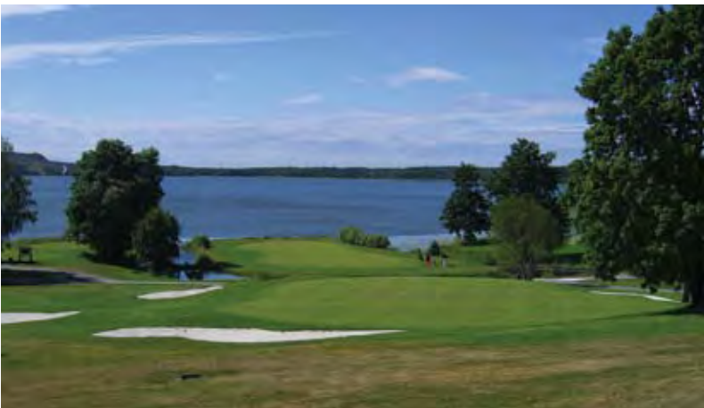
Ullna Golf Club

maneuver of our voyage. Enjoy the serenity of a tall ship gliding under full sail at sea. Relaxing on the sun-soaked deck of Sea Cloud II , you will find it hard to imagine a better setting to anticipate the golf that lies ahead.