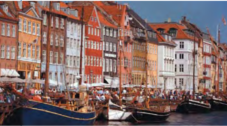
Copenhagen's Nyhaven Harbor

Depart your home city on June 25 for an overnight flight to one of Europe's foremost capitals, Copenhagen. On arrival, you are greeted and transferred to the five-star Hotel d'Angleterre on the historic Kings Square. The afternoon is at your leisure before our welcome reception this evening.