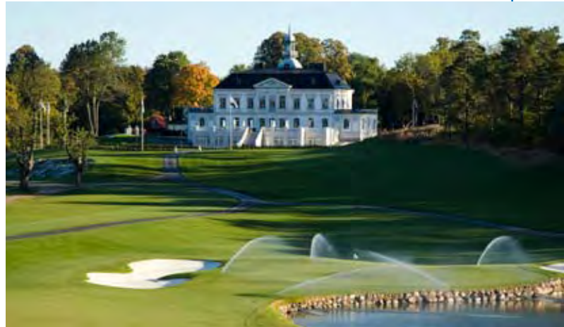
Bro Hof Slott Golf Club

Bro Hof Slott Golf Club. Opened in 2007, the stadium course is the first for architect Robert Trent Jones Jr. in Sweden. Already touted as the best golf course in the country, it will host the Scandinavian Masters from 2010-2017 and hopes to be a contender to host the Ryder Cup in 2018. With the beautiful Bro Hof Castle as the centerpiece, the course seems as if it has been there for years. Large, well-placed bunkers, plenty of water, big greens and beautiful landscape define this modern course with a classic touch.