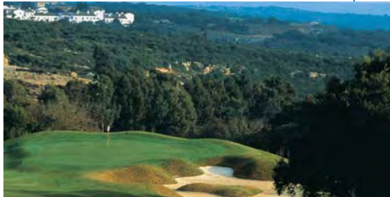
San Roque Golf Club