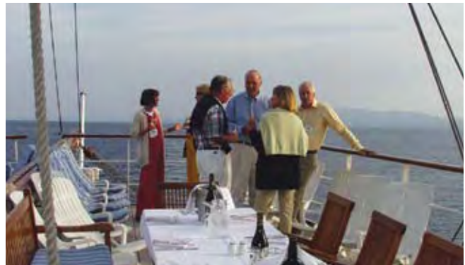
Dinner on deck

What better way to settle in aboard Sea Cloud II than to delight in a day at sea? Sit back and watch skilled deckhands scale the rigging and set the sails for the first sailing maneuver of our voyage. Enjoy the serenity of a tall ship gliding under full sail at sea. Visit the bridge where the officers will explain the operation of this fabulous ship. Relaxing on the sun-soaked deck of Sea Cloud II , you will find it hard to imagine a better setting to reflect on the golf that lies ahead.