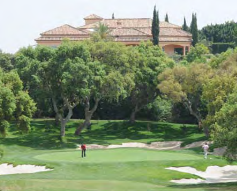
Club de Golf Valderrama

SEPTEMBER 8: GIBRALTAR, GREAT BRITAIN Club de Golf Valderrama. Regarded as the “Augusta National of Europe,” Valderrama has consistently been voted the #1 golf course in Europe and is also ranked among the world’s top 100 courses. An abundance of venerable cork oak and olive trees give each of Valderrama’s golf holes a distinctive shape and look. The playing conditions are impeccable and the setting is bucolic. Having been the site of the 1997 Ryder Cup, Valderrama provides a historic golf location as well. All passengers will have the opportunity to visit one of the most famous geological silhouettes in the world, Gibraltar. The view from the Rock provides a spectacular panorama of North Africa, the Costa del Sol and the Mediterranean Sea. Touring passengers will delight in our special visit to St. Michael’s Cave and the Nature Reserve to see Gibraltar’s most famous inhabitants, the Barbary apes.