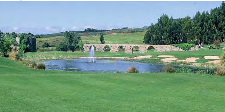
Penha Longa Golf Club

Depart your home city on September 3 for an overnight flight to one of Europe’s most beautiful cities, Lisbon. Upon arrival, you are greeted and transferred to the five-star Pestana Palace. Spend the afternoon at your leisure before our welcome reception this evening.