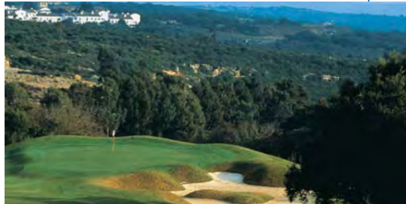
San Roque Golf Club