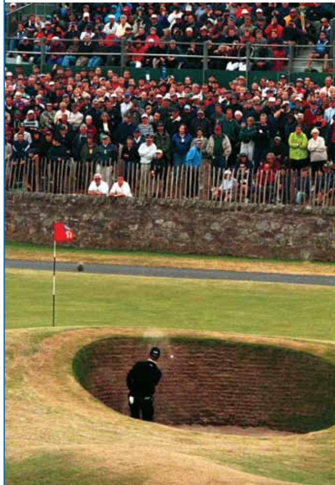
17 th hole — The Old Course

There is no better way to enjoy our host vessel than a full day at sea aboard Clipper Odyssey . Enjoy the leisurely pace of travel as the ship glides around the coast of Scotland en route to Northern Ireland. There will be plenty of time for relaxing after four days of golf.