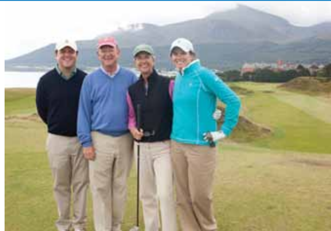
Kalos Golfers at Royal County Down

Those on tour visit two marvels of the Antrim Coast. Our first stop is at the Giant's Causeway, a natural rock formation often referred to as the eighth wonder of the world. Further down the road lies Dunluce Castle, precariously situated on a cliff overlooking the sea. Lunch is a fine sampling of local cuisine at The Bushmills Inn.