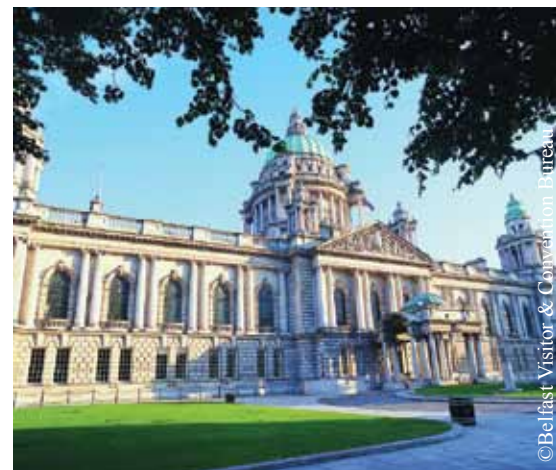
Belfast City Hall

Designed by Old Tom Morris, The Royal County Down Golf Club is admired as one of the most beautiful golf courses in the world and is consistently ranked among the world's top five. Laid out through giant sandhills along a narrow strip of land between Dundrum Bay and the Mourne Mountains, Royal County Down offers spellbinding scenery and a fine test of golf.