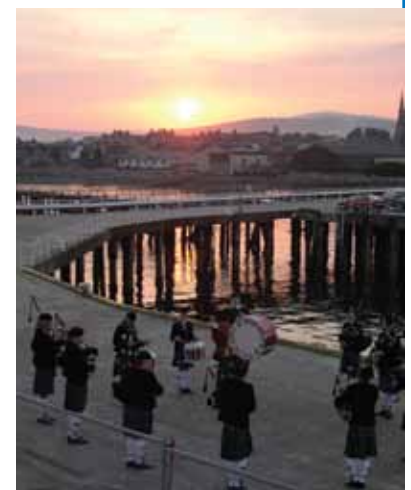
Dornoch Pipe Band

Those on tour have the opportunity to visit the unspoiled Edwardian town of Dornoch. Our visit includes the small and charming Dornoch Cathedral, which dates back to 1224. We also tour the famous Dunrobin Castle where we attend a demonstration of the noble art of falconry.