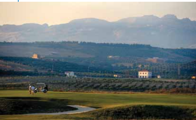
Verdura Golf Resort

Golfers will not be disappointed as they return to Verdura for a second round of golf—but this time on the West Course. The West garnered the highest rating among Italy's golf courses in the newly published Rolex World's Top 1,000 Golf Courses. The highlight of the day is certain to be the final four holes, a stirring collection of seaside holes culminating with the spectacular eighteenth played from a tee built on a promontory next to the sea.