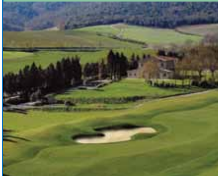
Drago Golf Club

Depart your home city on September 8 for an overnight flight to Florence, Italy. Upon arrival, you'll be greeted at the airport and transported to The Grand Hotel Continental, located in the heart of Siena, in what was once a private 17 th century palazzo.