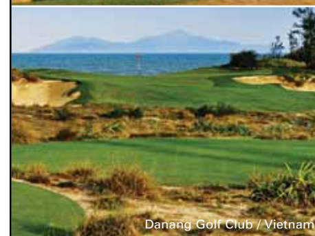
Danang Golf Club / Vietnam