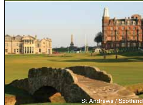
St Andrews / Scotland