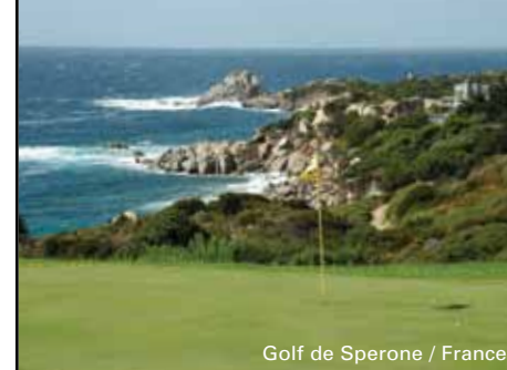
Golf de Sperone / France

We bid farewell to Sea Cloud II and her crew as we disembark and transfer to the Valletta Airport for return flights home.