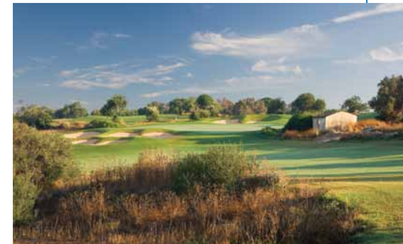
Donnafugata Golf Resort

Sea Cloud II docks below the cliffside town of Taormina, with its spectacular views of the Ionian Sea and breathtaking Mount Etna. Our tour of Mount Etna leads us up the lava flows and snow-covered slopes to explore one of Europe's natural wonders. After our memorable visit there, we have plenty of time to explore the romantic winding streets of Taormina, a town often compared to Positano and Eze, France.