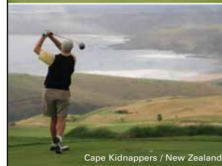
Cape Kidnappers / New Zealand