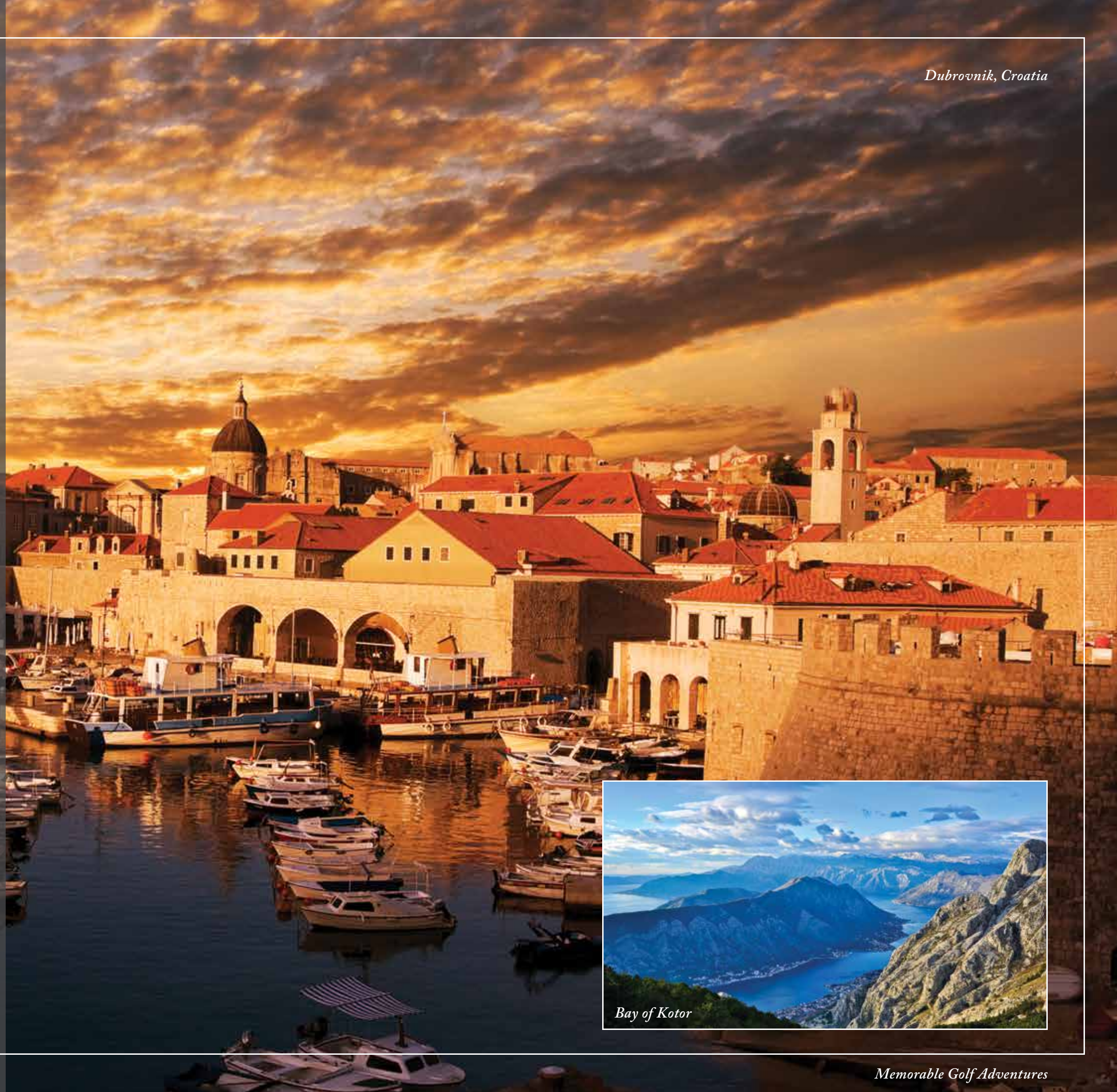
Bay of Kotor

Sea Cloud II sails into the dramatic Bay of Kotor, a spectacular fjord surrounded by steep, majestic mountains. All passengers have the opportunity to tour Kotor, one of the Adriatic's best-preserved medieval towns. Ancient stone fortifications stretch through the hills above Kotor, whose entrance is marked by three gates. With a panoramic backdrop of the magnificent bay and mountains, our day in Kotor is always a highlight of our Adriatic cruise.